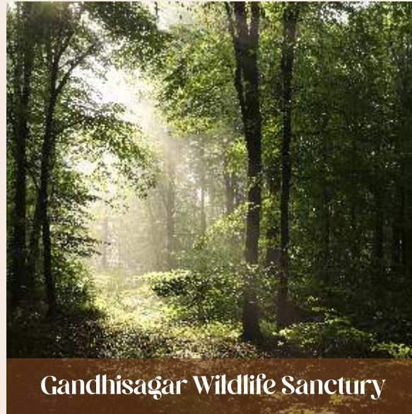
Gandhisagar Wildlife Sanctuary